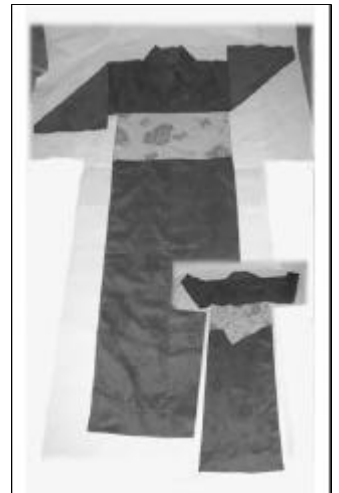
< 3> 3