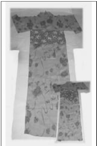
< 1> 1