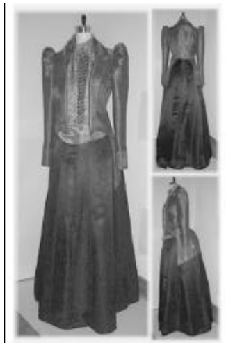
< 2> 2