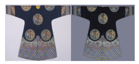
Figure 16. Jifugua.

The dragon and phoenix patterns in Qing dynasty costumes are very colorful but use only the traditional